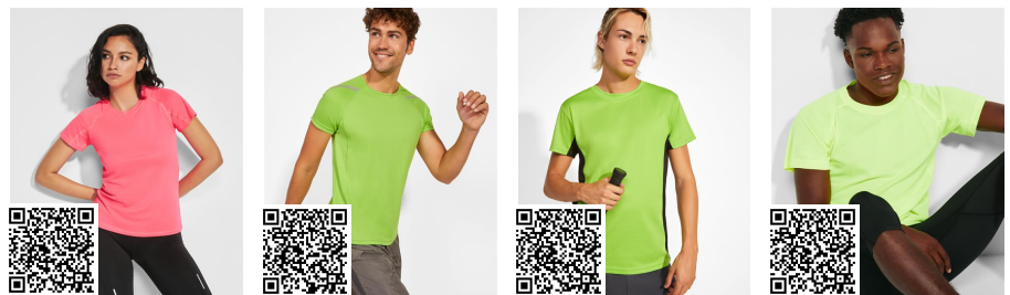
BAHRAIN WOMAN CA0408