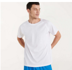
Duo Concept CA0425