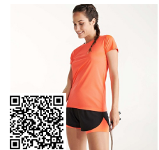
IMOLA WOMAN CA0428