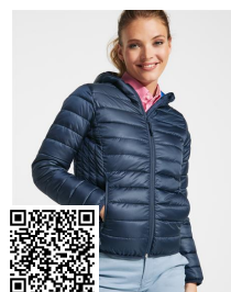
NORWAY WOMAN RA5091