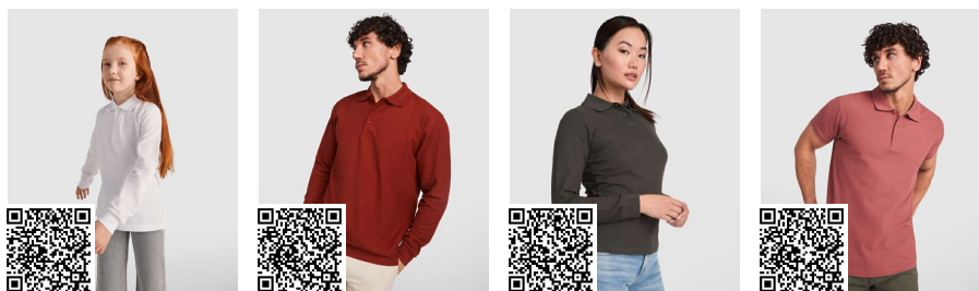
CARPE CHILD PO5008