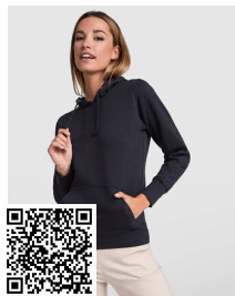
URBAN WOMAN SU1068